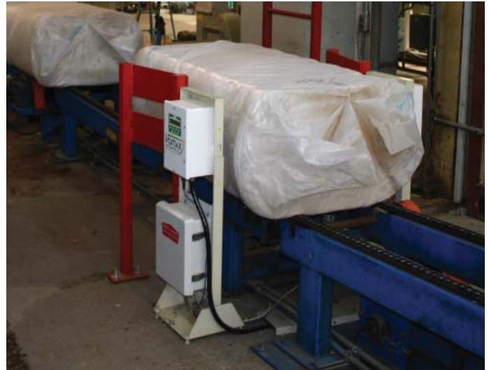
A Vomax Bale Moisture Sensor in operation at Holly Ridge Gin in Indianola, MS.

The Tex-Max logo incorporates the sensor's Australian roots and its new West Texas manufacturing home.