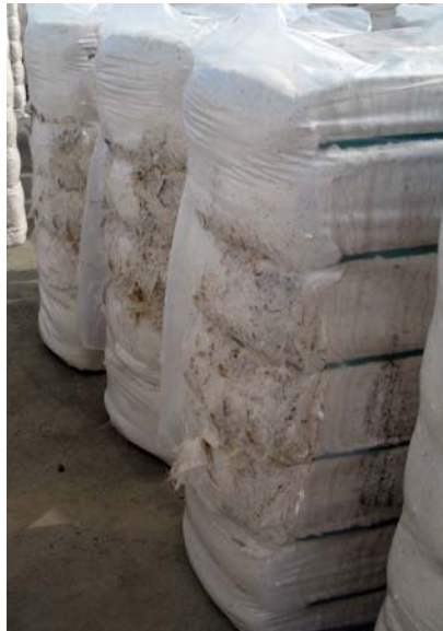
The picture shows bales damaged by a gin using a water spray moisture restoration device.

The information Certified Cotton provides is best used in conjunction with classing data to determine the best bales to buy. Traditional classing data is used to determine if a bale has desired fiber characteristics such as color, leaf, length, strength, and micronaire. Certification addresses factors not considered by high volume instrument (HVI) testing, yet vitally important to cotton suppliers and users. For example, in the last five or six years, many gins have revived an old fad of using water spray devices to restore moisture to lint before baling. While the results of this practice can be very apparent (see picture below), damage normally appears after a period of storage. Damage can also be internal to the bale and not viewed until it is opened at a spinning mill. Classing data does not predict, nor detect damage from water spray devices. As a requirement, Certified Gins do not use water spray devices, so their bales are free from this type of damage.