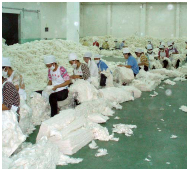
Mill workers tediously separate each bale by hand to ensure that it is free from contaminants.

The final requirements of Primary Certification — having a contamination prevention policy, moisture measurement standards, and trained personnel relating to these issues — have obvious benefits, but are found at very few gins. These requirements, while beneficial to the gin, are examples of the extra care that Certified Gins take to provide the best product for the mill. For example, a contamination prevention policy offers little to positively affect a gin's bottom line. In contrast, contamination's impact on production and efficiency are so great that many mills employ hundreds of people to sort each bale by hand to prevent contamination from entering their facility. The Contamination Prevention Policy in place at each Certified Gin assures mills that special steps have been taken to reduce the possibility that any contamination enters the bales they process.