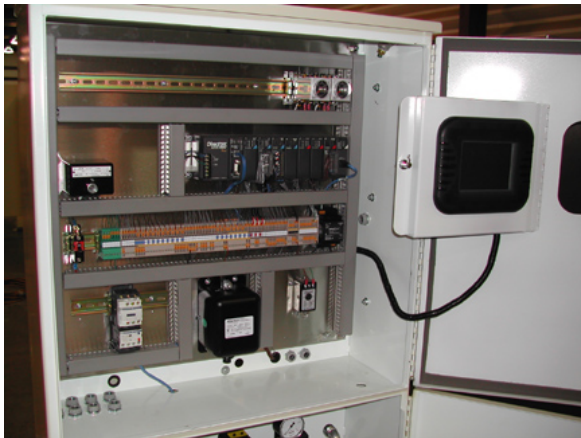
The local touch screen pivots inward to act as a convenient help display for the operator and technician.