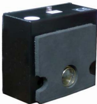
A single 23400 Argus Infrared Spark Detector.

Spark Detectors mount flush to the side of a pipe or duct and monitor through a small sealed cutout. They use infrared technology to pinpoint single sparks at speeds up to 200 feet per second. By comparison, cotton typically flows at 75 feet per second in gin pipes. Upon detection, a control action can be used to contain further spread of the spark in 1/20th of a second. The infrared field is produced at a ninety degree angle from the detectors giving it a very wide viewing area. Additional sensors can be added for better coverage and protection.