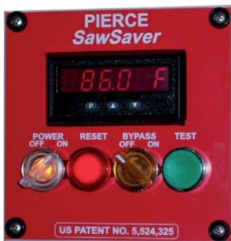
An original Pierce SawSaver Controller.

SawSavers put your mind at ease about gin stand rib fires.