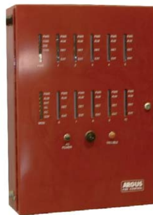
A 23401 Argus Z-1 Control Panel is economical and easily expands to monitor up to 10 Zones.

The Argus Fire Prevention System consists of a Control Panel and Spark Detectors. Each Control Panel can support up to 10 zones when equipped with an equal number of zone cards. A zone is considered any location in the gin that sensors are monitoring and would typically consist of two to four sensors. Zone examples might be above the module feeder pick-up point, before the pre-cleaning system, behind individual gin stands, in the lint flue riser or any other spot that fires are prone to break out.