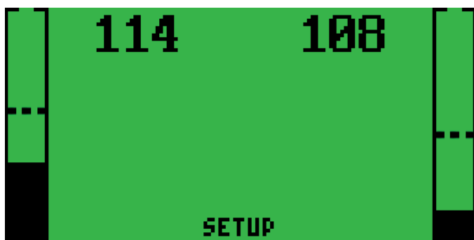
The SawSaver with ROC Technology interface.

Get the most from your SawSavers with ROC Technology!