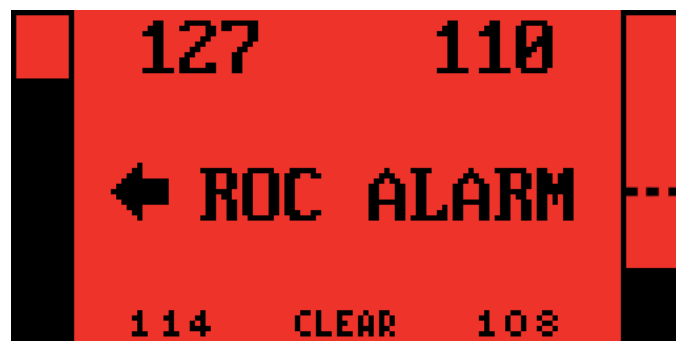
The SawSaver interface with the left side in an alarmed state.

Tag detection is visualized by indicator bars on both sides of the interface. When a bar rises quickly, a tag has formed between two ribs. The dotted line on the indicator bar is user definable and sets the responsiveness of the ROC Technology. When either bar crosses this line, the alarm is triggered, the gin stand kicks out and the interface turns red. An arrow also indicates which side of the stand the tag is located. The ginner can then safely remove the tag and press any button on the interface to clear the alarm and resume ginning.